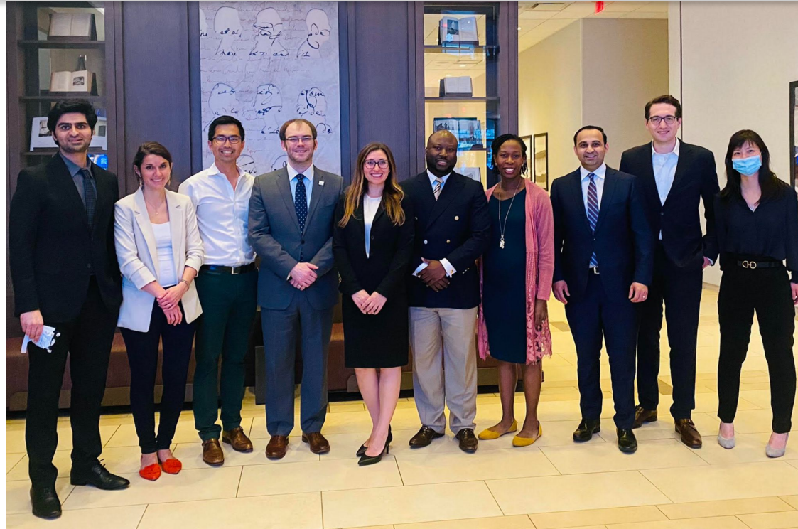
The TSRA Executive Committee at AATS 2022