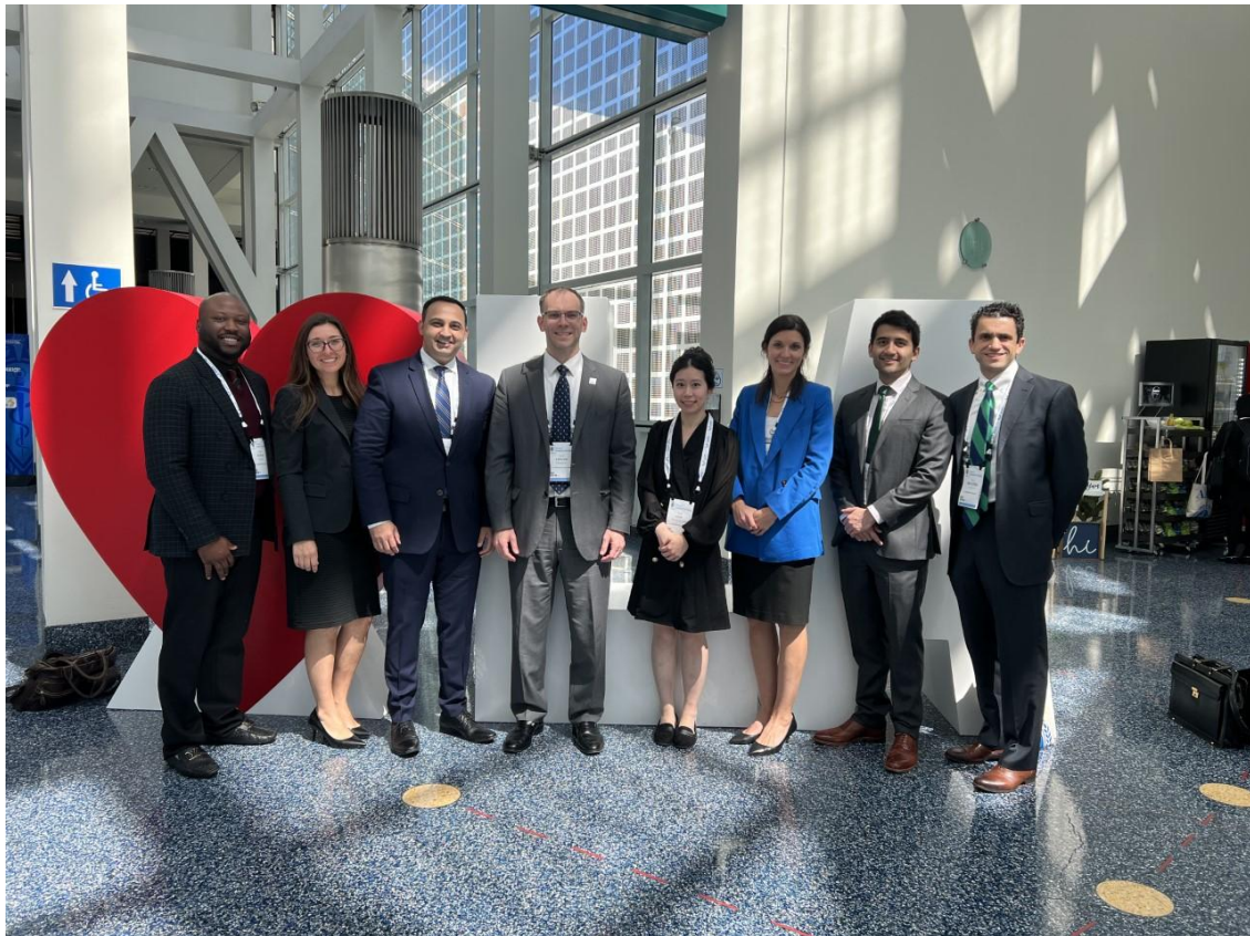
The TSRA Executive Committee at AATS 2023