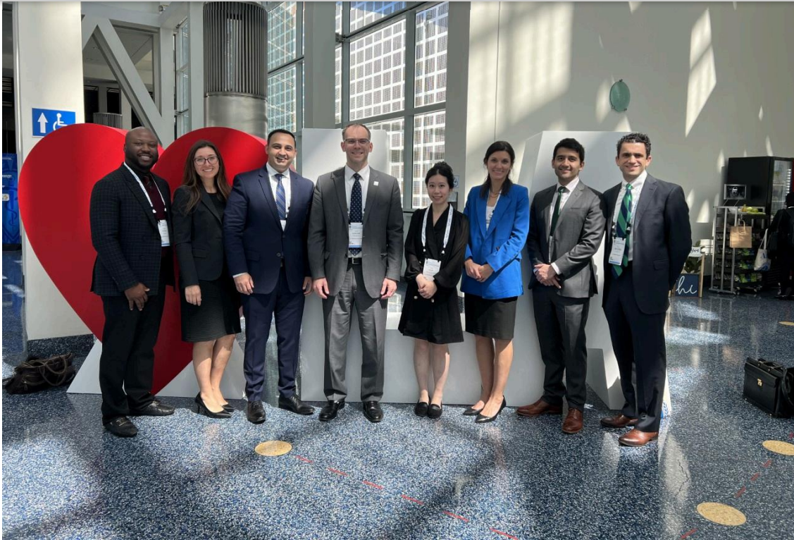
The TSRA Executive Committee at AATS 2023